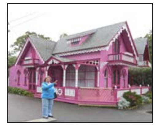
The most famous cottage may be The Pink House. Ironically, it's owned by a Texas family who proudly fly a Lone Star flag (a great color match!) when they are in residence.