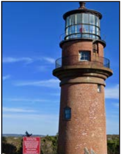
The cliffs have suffered severe erosion, so the lighthouse was moved 134 feet inland in 2015 to its present location.

to the Martha's Vineyard Historical Museum and will soon be on display in Vineyard Haven.