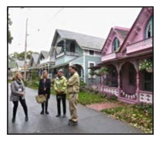
With limited vehicular traffic, the JANE occupation army was free to reconnoiter at will in the middle of the street.