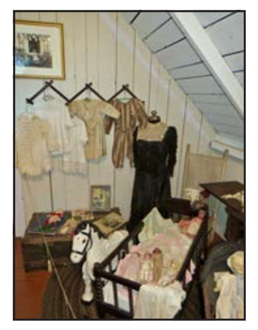
Here is the baby's room and some typical 19<sup>th</sup> century clothing.

Initially, cottages lacked running water and required use of outhouses. Food was also cooked away from the cottages, so additions adding first floor kitchens and bathrooms are often visible where these were added before the Camp became a National Historical site.