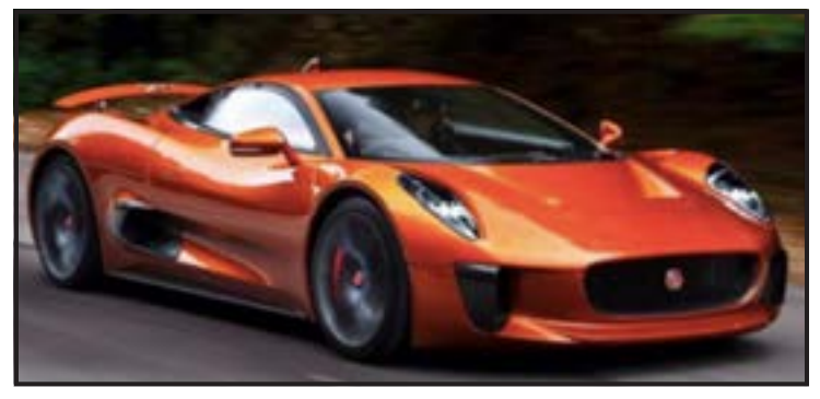
A rendering of an imagined J-Type. (It's not clear when this was created.)

If you follow automotive blogs (I follow two of them), every now and then you run across a piece about Jaguar. In recent months, I've run across three pieces suggesting that a new high-performance Jaguar may be well into design stages, possibly even prototyping. The story goes something like this: a mid-engine hybrid sports coupe would replace the F-Type, supporting Jaguar's move toward electric cars as well as its tradition as a manufacturer of high-performance cars. This might all come to some sort of fruition in 2020, or so.