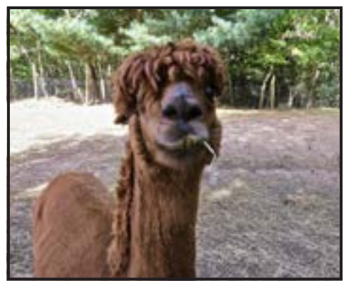
Toast looks like he's having a Bad Toupee Day after his shearing.

Alpacas are related to camels and llamas, and have been domesticated for annual shearing of their soft, luxurious hair, which, unlike wool, is hypo-allergenic because it lacks lanolin.