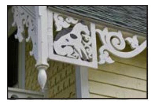
Hidden in the gingerbread decoration of many cottages are carvings of animals, like the dog in this wooden filigree.

Owners are free to name their cottages whatever they desire and paint them any variety of colors, but have severe restrictions on any alterations to the outside. Edie explained that cottages are generally Romanesque or Gothic in style. The house with windows and doors coming to a point at the top like medieval cathedral doors are in the Gothic style. Cottages with rounded or square door and window tops are Romanesque.