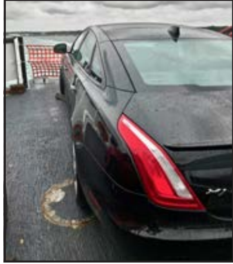
On the return voyage, we were the last onboard an early ferry, so were ready to leap ashore first in Woods Hole for our victory parade back to Burlington.