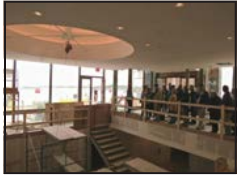
We toured the building and were shown the future home of the firstorder Fresnel lens from Gay Head Lighthouse.

About that Fresnel-lens light: after erecting the light's revolving mechanism, each of the 1,011 glass reflecting surfaces will be assembled with a diamond cutter's precision inside the Museum building's addition. The Museum hopes to be granted permission to illuminate the light on special occasions.