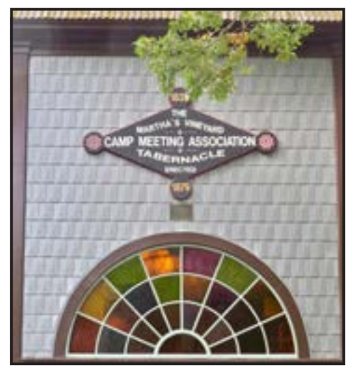
The current permanent Tabernacle was completed in 1879 and featured a wrought iron structure designed by the Hoyt Foundry in Springfield, MA.