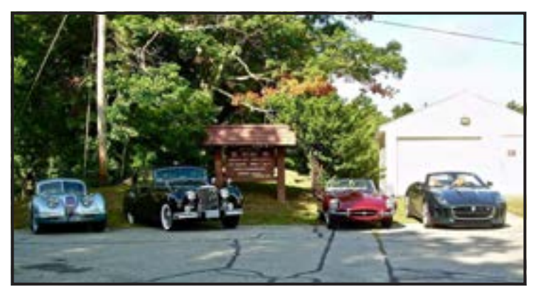
Jaguars, just hanging out!