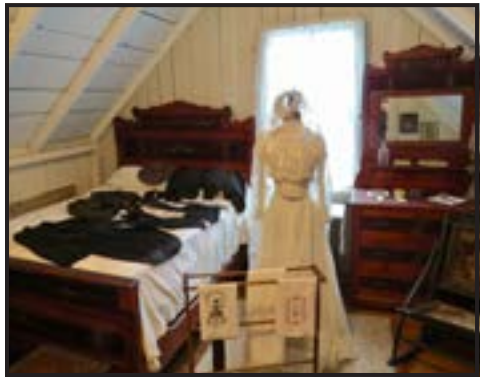
Museum Cottage, parents' bedroom.

There are 312 cottages in the Camp Association; about 10% are occupied year round and an additional 10% are winterized. The rest are suitable only in temperate weather, like this museum cottage, here showing the parents' bedroom.