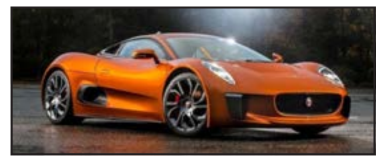
And here's a rendering of a Jaguar C-X75 from Jalopnik this year.