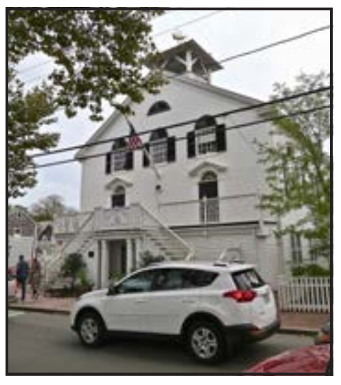
Edgartown Town Hall.

our contributions have helped expand the Museum's reach.