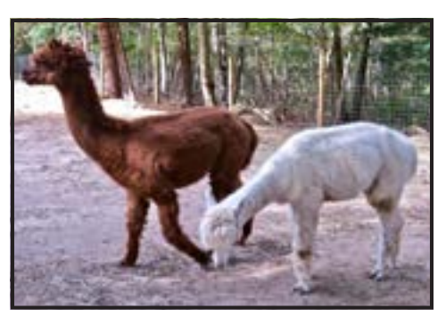
"Oh, Give Me a Home Where the Alpacas Roam ..."

Happily, the inn maintains a small farm, featuring 50 chickens and four alpaca brothers: Toast, Butter, Marco, and Hamilton. This means that provisions won't be a problem, especially at breakfast (I'm thinking especially of toast and butter here, perhaps some eggs as well)!