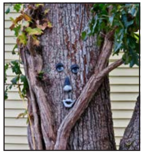
The whimsy even extends to the local foliage.

There are 312 cottages in the Camp Association; about 10% are occupied year round and an additional 10% are winterized. The rest are suitable only in temperate weather, like this museum cottage, here showing the parents' bedroom.