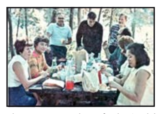
Then, as now, we take our food seriously!

The other people motored to the dam site in domestic conveyances. Additional archival photos show the picnickers enjoying their lunch and posing as a group.