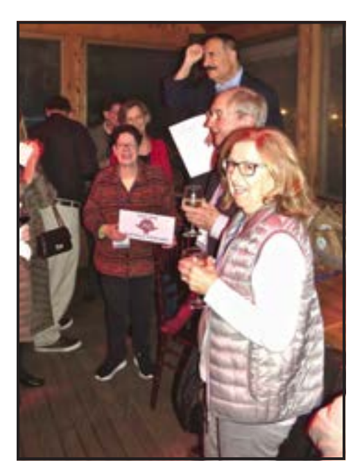
. . . although he does appear to have forgotten where he parked his staff car.