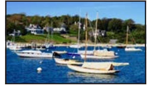
The tranquil harbor scene revealed that we had the crucial element of surprise in our favor.