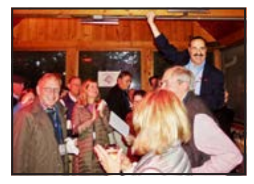
As you can see, our fearless leader predicts total victory in our island campaign . . .

Our force lived off the land during the weekend. Our first night saw an engagement in Edgartown, at Lucky Hank's, whose management avoided outright expropriation of their restaurant by providing us with a most welcoming wine and cheese hour. We were so impressed with the quality of our subsequent dinners that we not only paid the cost but also tipped their waitstaff generously.